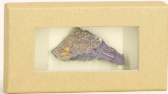
CHARGE Λ14598 - ACRYLIC, CARDBOARD - 12 x 7 x 3 cm - 2017