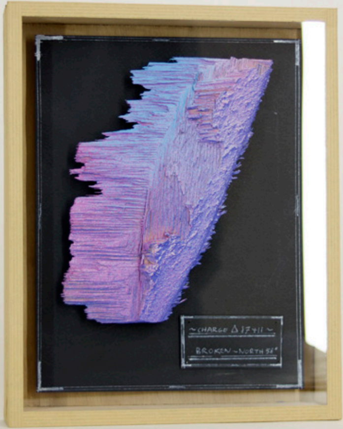
CHARGE Δ 17411 - ACRYLIC, WOOD - 24 x 30 x 5 cm - 2017