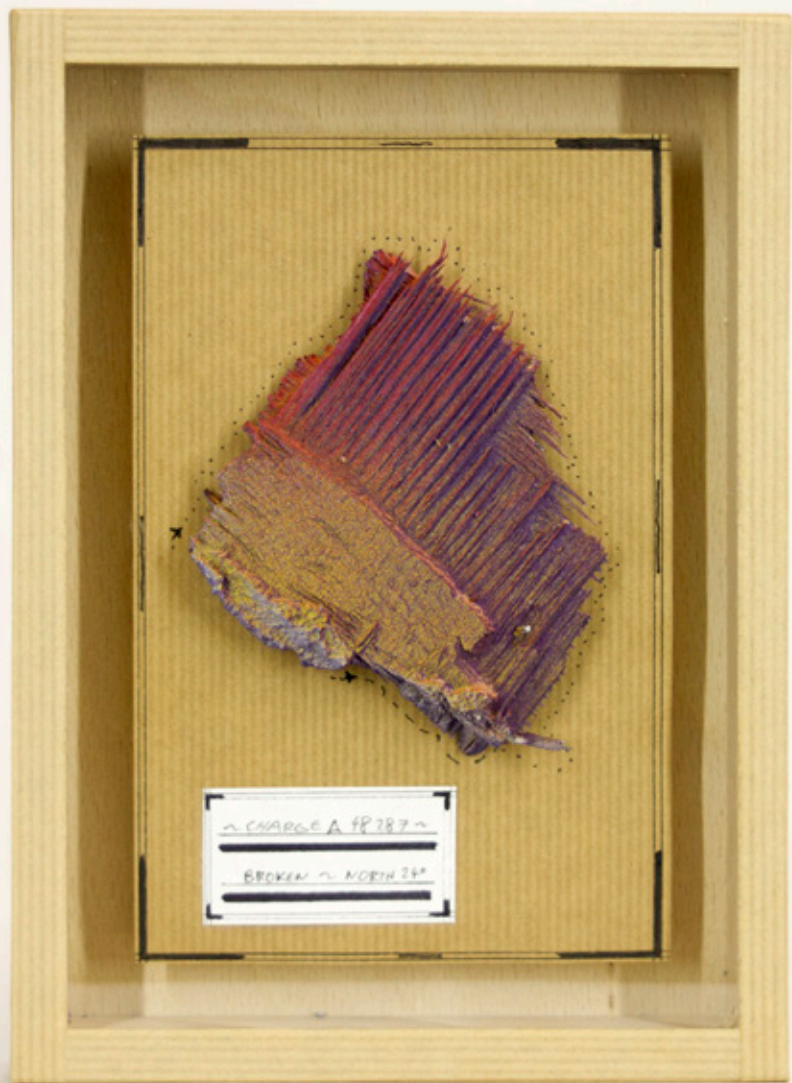
CHARGE A48287 - ACRYLIC, WOOD - 16 x 22 x 3 cm - 2017