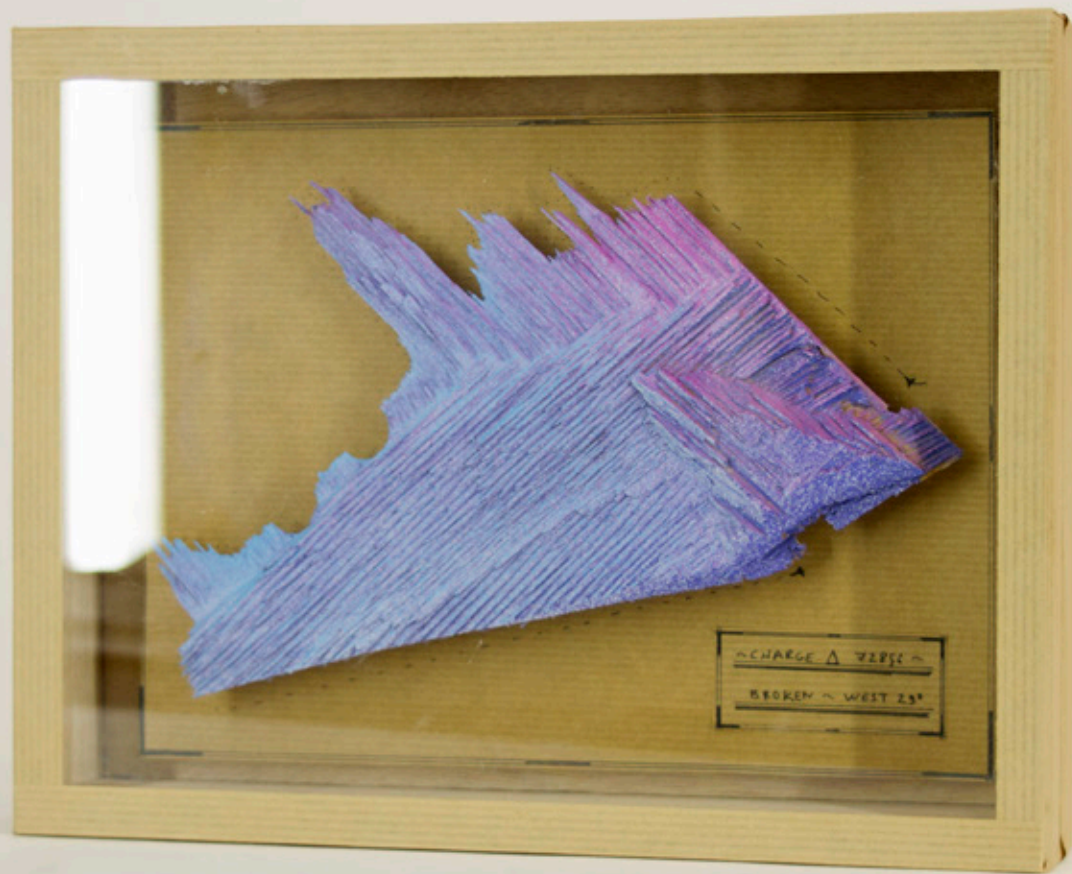
CHARGE Δ72856 - ACRYLIC, WOOD - 27 x 21 x 6 cm - 2017