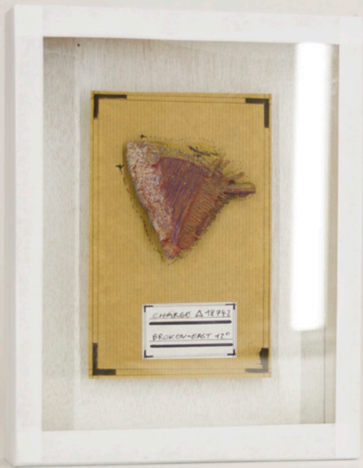
CHARGE A18742 - ACRYLIC, WOOD - 21 x 27 x 6 cm - 2017