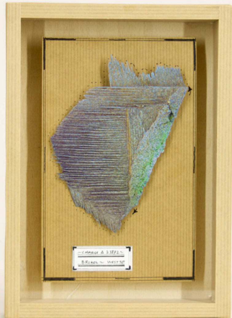
CHARGE Λ23872 - ACRYLIC, WOOD - 16 x 22 x 3 cm - 2017