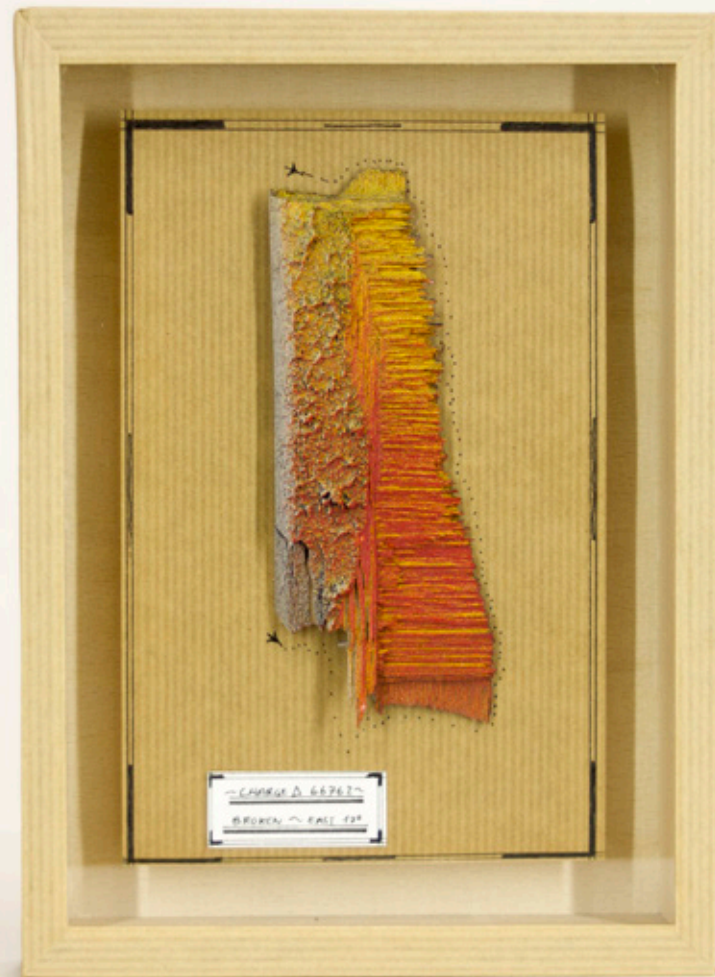
CHARGE Λ66762 - ACRYLIC, WOOD - 16 x 22 x 3 cm - 2017