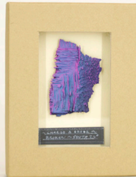
CHARGE Λ67542 - ACRYLIC, CARDBOARD - 14 x 18 x 3 cm - 2017