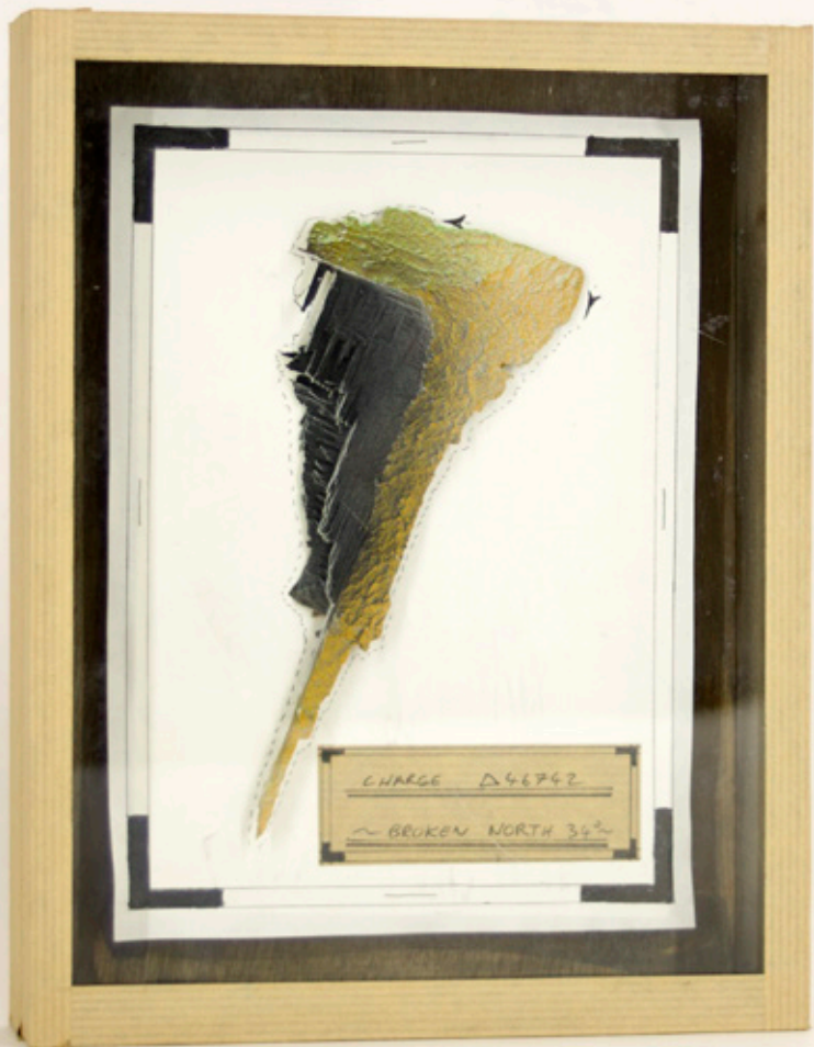
CHARGE Δ46742 - ACRYLIC, WOOD - 21 x 27 x 6 cm - 2017