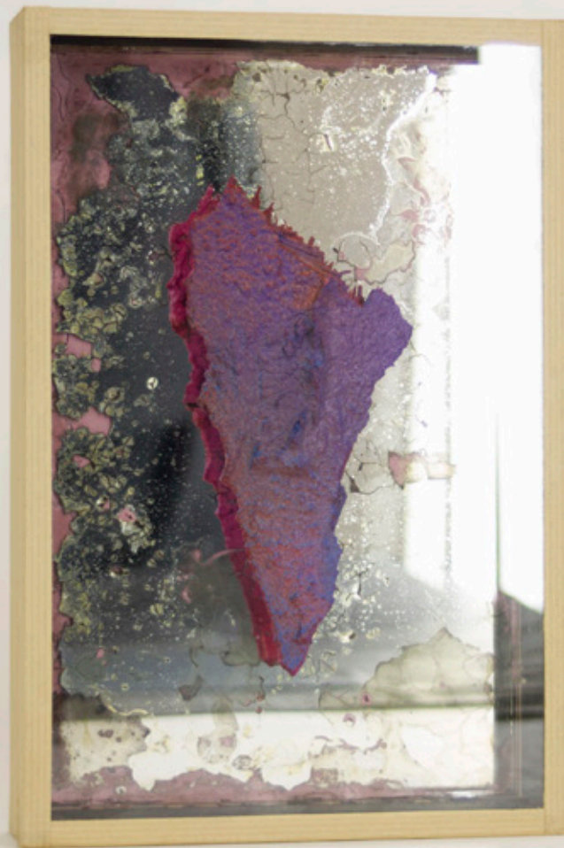
CHARGE Λ655374 - ACRYLIC, WOOD - 20 x 30 x 5 cm - 2017